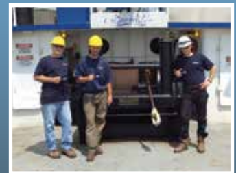
TES-22 BUILT in 1956 on board the TUG "SPECIALIST"

SERVICE THAT LASTS A LIFETIME CONTACT US TODAY